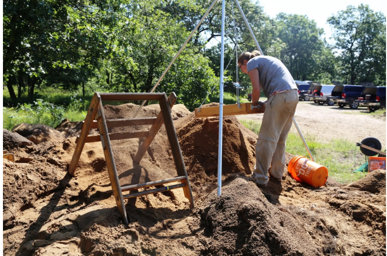
Fort McCoy, WI, 07.06.2017. A member of the archaeology team with Colorado State University's Center for Environmental Management of Military Lands under contract with Fort McCoy works at an active phase III archaeological dig. Team members found many types of artifacts, such as pottery, dating back thousands of years.