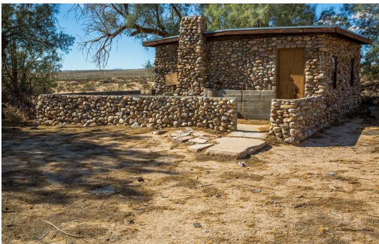
Twentynine Palms, CA, 09.25.2015. Conservation Law Enforcement Officers protect natural and cultural resources at Surprise Springs archaeological site through law enforcement.

Agencies should recognize that the reuse of historic properties avoids demolition and land-fill costs and supports federal energy and environmental conservation goals.