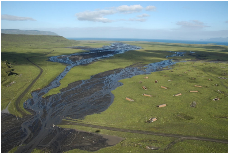
Fort Glenn, AK. 09.14.2008. Army engineers remove World War II-era explosives from a National Historic Landmark on remote Umnak Island.

A successful historic preservation program fosters, develops and expands agency-wide policies, procedures, and activities that further the stewardship goals of the National Historic Preservation Act. These programs: